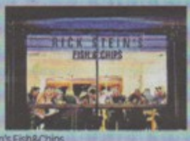
St Michael's Hotel & Spa in Falmouth and Rick Stein's Fish & Chips