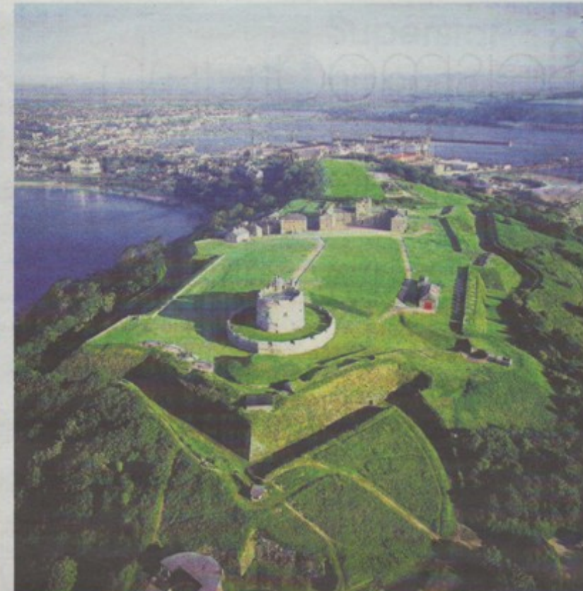
The formidable Pendennis Castle with Falmouth harbour and town beyond