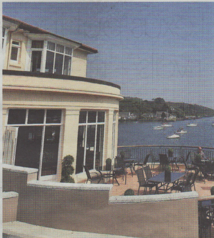
Greenbank Hotel, overlooking Falmouth Harbour, is the perfect place to watch the world go by

It's a good job that Falmouth can handle the rain.