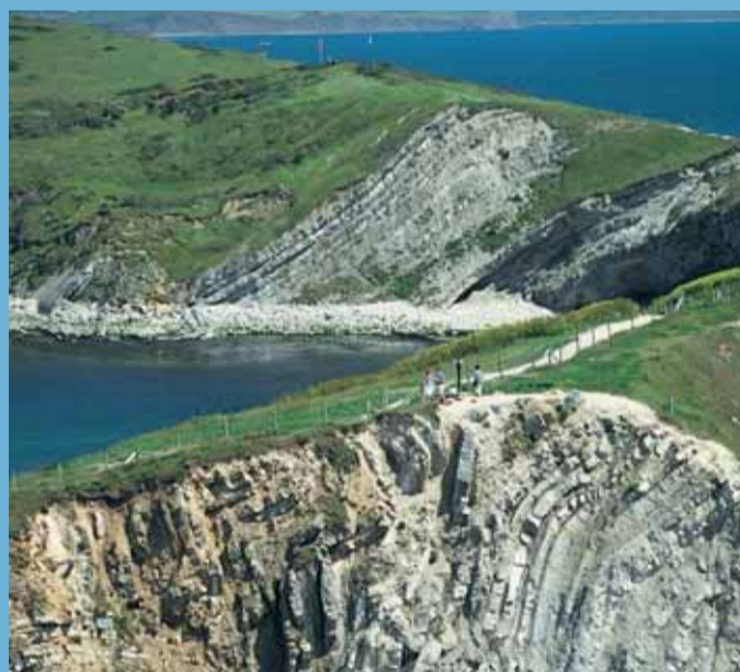
Stair Hole, Dorset

Look for evidence of ancient deserts or fossil forests, track the dinosaurs on the Jurassic Coast. Follow the path across granite, serpentine, primeval seabeds and coral reefs.