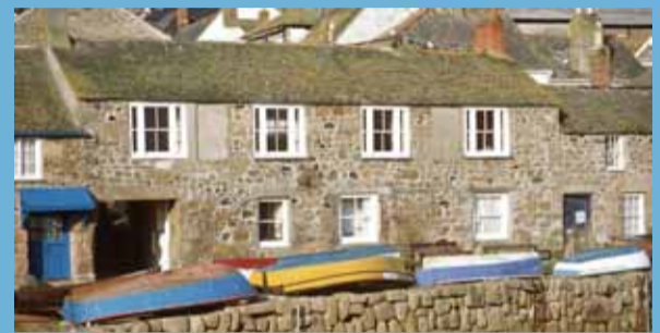
Mousehole, South Cornwall

the nooks and crannies of the stunning coastline. Choose from rugged cliffs or sheltered coves and valleys. Visit fishing harbours busy or quiet with the ebb and flow of the tide, or bustling ports and resorts, each one unique.