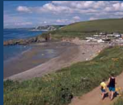
Challaborough, South Devon

Think of South West England and you think of its superb and varied coastline. The South West Coast Path National Trail is a remarkable footpath that follows this largely unspoilt coast for 630 miles. From Minehead on the edge of the Exmoor National Park all the way to the shores of Poole Harbour it is simply the best way to enjoy the wonderful coastal scenery, wildlife and heritage.