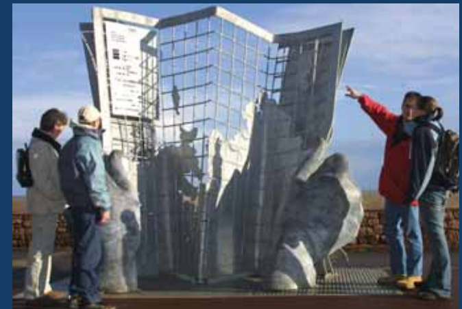
At the Minehead end of the Coast Path

Guided walks (both short and long) and other events and activities take place along the Coast Path throughout the year. These are led by Coast & Countryside Services, the National Trust and a wide variety of other organisations. Details can usually be obtained from local Tourist Information Centres.