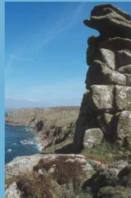
Near Sennen, West Cornwall