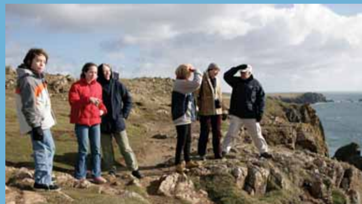
Kynance Cove, South Cornwall

bask in the endless pink of sea thrift, the rolling heather with splashes of yellow gorse. Hear the call of the peregrine, spot an elusive seal or pod of dolphins.