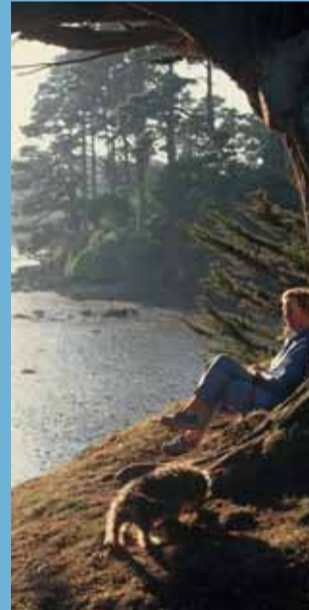
Gillan Creek, South Cornwall

in the cool breeze on the headland, beside tranquil estuaries with clinking boat masts. Sit and think with the sun on your back. Contemplate the lone tree sculpted by winter gales.