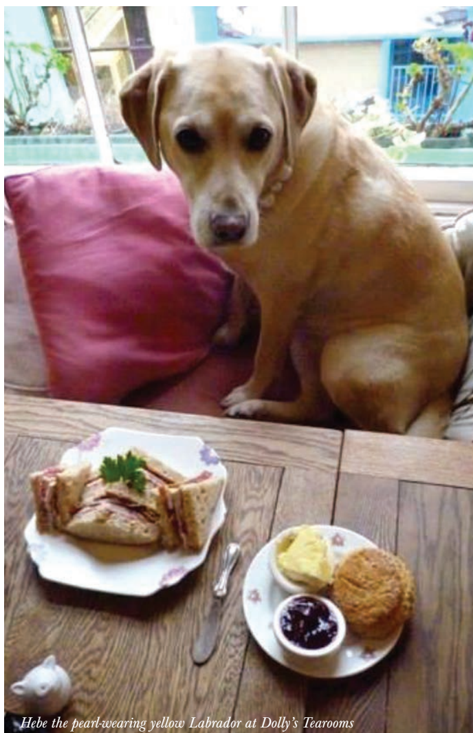
Hebe the pearl-wearing yellow Labrador at Dolly's Tearooms

After a hearty breakfast where there was a choice of Continental or hot buffet with fantastic panoramic views over